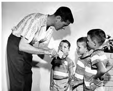
As a young father, Carson performed a magic trick for his three sons.

When Carson decided to call himself "The Great Carsoni," his mother created a black cloth with the name embroidered on it to drape on a magic table. She gave it to him when he turned 13. He used it when he made his professional debut the next year