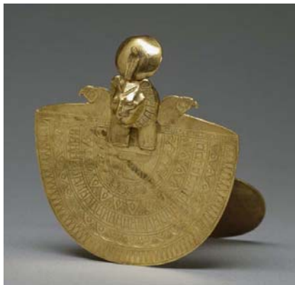
Usekh (neck collar) with gold lioness head 700 BC