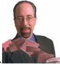
Jamy Ian Swiss