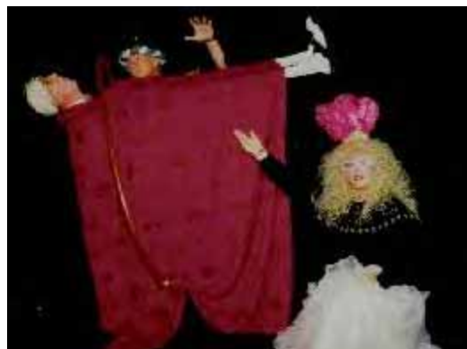
Kohl & Co. trio noted for its wild antics

Beautiful location--Meeting rooms with 500-seat auditorium on a 63-acre horse farm Hotel and restaurants nearby