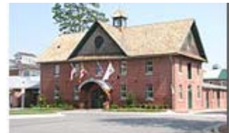
The Arts Barn in Gaithersburg

Contact: Tickets are available at the Smithsonian Resident Associates Office, (202) 357-3030 M-F 9 a.m. to 5 p.m.