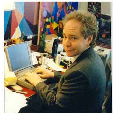
TELLER TALES -- Teller of the magic team of Penn and Teller provided the magic for the play. He first became entranced with Macbeth as a boy.